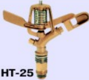
HT-25 P = 2Kg.-4Kg. D = 40-60 LPM R = 33m-38m