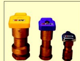
Brass quick coupling valve with brass cover Size : 3/4"-1 1/2"