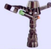
5035 G 1 F Q = 0.73-4.6m 3 /h D = 36.0 m