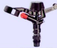
5035 3/4 M Q = 0.73-4.6m 3 /h D = 36.0 m