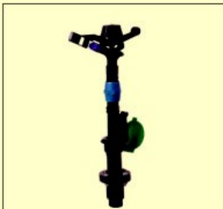
Plastic hydrantopener with plastic Nozzle