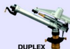
DUPLEX R = 20m-43m D = 159LPM-657LPM P = 2Kg.-6Kg. Size = 2" BSP