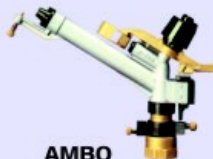
AMBO R = 20m-29m D = 76LPM-406LPM P = 2Kg.-6Kg. Size = 1 1/4" BSP