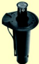
Rain Bird Eagle™ 700 *Radius : 16,8-24,4 (m) (55'-80') *Flow rate : 16.8 to 44.1 GPM *Operating Pressure : 60-100PSI