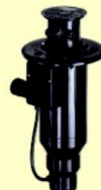
TORO 760 Series Pop-up *Radius : 17m-24m (55'-78') *Flow rate : 11.7 to 41.2 GPM *Operating Pressure : 50-100PSI