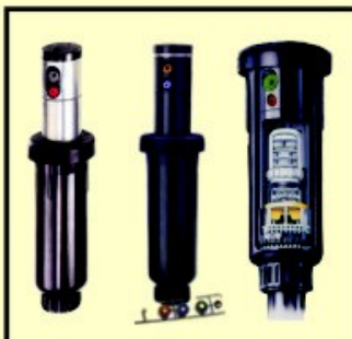
TORO 2001 series Size : 1"