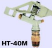
HT-40M P = 4Kg.-7Kg. D = 178-233 LPM R = 52m-58m