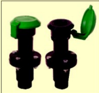
1" Plastic Quick Coupling valve/hydrant