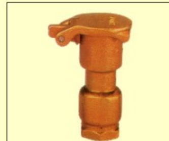
Brass quick coupling valve with brass cover Size : 3/4"-1 1/2"