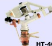
HT-40PC P = 3Kg.-6Kg. D = 148-210 LPM R = 25m-31m