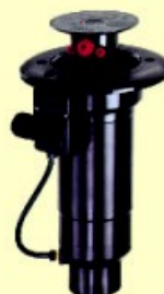
TORO 780 Series Pop-up *Radius : 17m-26.5m (55'-87') *Flow rate : 12.3 to 50.1 GPM *Operating Pressure : 50-100PSI