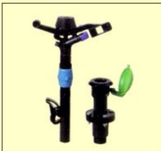
Plastic Quick Coupling valve/hydrant with opener & Nozzle