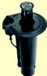
Rain Bird Eagle™ 750 *Radius : 17,1-25,0 m (56'-82') *Flow rate : 11.0 to 39.6 GPM *Operating Pressure : 60-100PSI