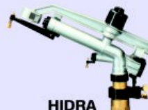
HIDRA R = 20m-36m D = 152LPM-533LPM P = 2Kg.-6Kg. Size = 1 1/2" BSP