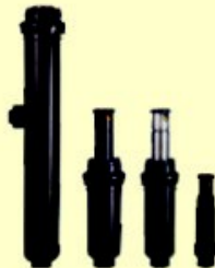
Toro 700 Series Sprinklers *Radius : 6-16m (20'-52') *Flow rate : 4.2-3.75 LPM *Operating Pressure : 1,7-5.2 bar (25-75PSI)