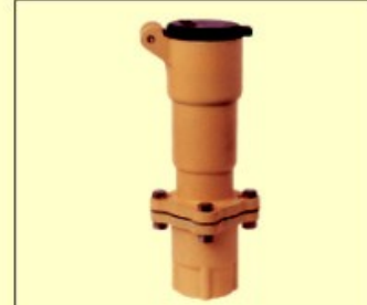
Aluminum quick coupling valve/hydrant Size : 1/4"-1 1/2"