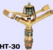
HT-30 P = 2.5Kg.-4.5Kg. D = 76.90-95.50 LPM R = 40m-44m