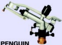
PENGUIN R = 19m-38m D = 106LPM-311LPM P = 2Kg.-5Kg. Size = 1 1/4" BSP