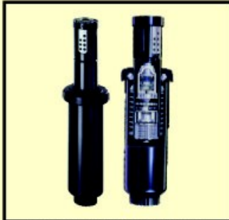
TORO V 1550 series Size : 3/4"